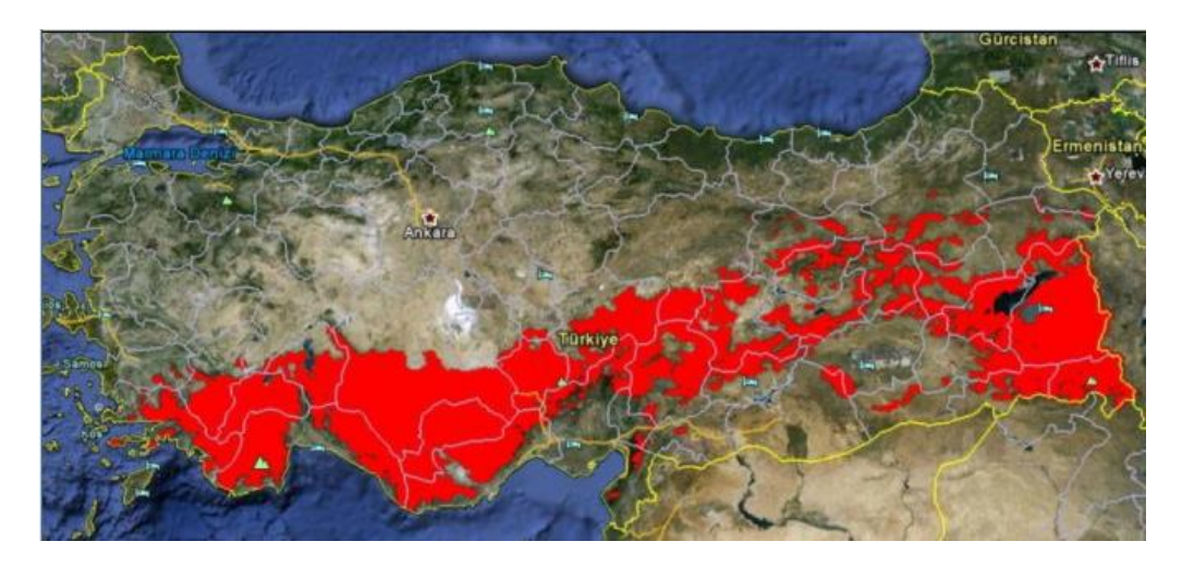
Figure 4: Map showing the suitable areas for licensed generation

Licensed generators are going to be decided based on the competitive bidding process on the 600 MW of designated capacity across the country. Licensed generation will be restricted to those regions that receive over 1650 kWh/m2 of annual solar radiation with varying capacity limits set for each region. After the process begun on 2013, around 9 GW of applications were filed. These installations will actually sell their electricity at the same feed-in tariff price of 13.3 dollar cents per kWh. However, they are also required to submit a financial contribution proposal of a certain amount per MW to the Turkish Electricity Transmission Company. They are required to pay the proposed amount in the first three years after they have begun operations. Those applicants that have offered the most amounts will be given licenses. Therefore, it can be expected that their ultimate income per kWh of electricity generated will be significantly lower compared to unlicensed generators. On the other hand, since the licensed installations will be on a substantially larger scale, their system costs would be less than unlicensed installations due to the economy of scales.