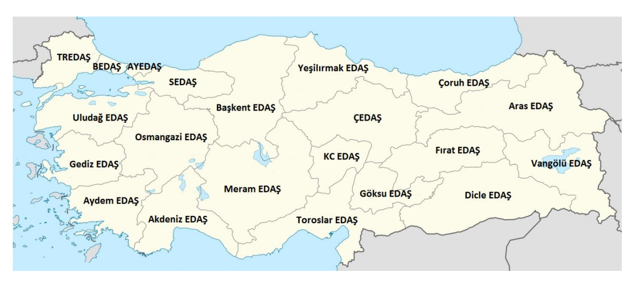
Figure 2: 21 Electricity distribution regions and utility companies